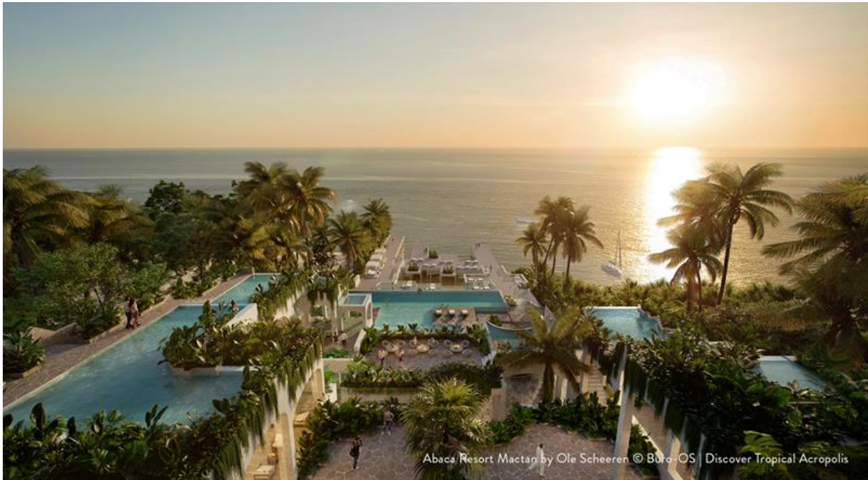
Set to be completed in 2024, the new Abaca Resort Mactan is CLI's very first resort development and will feature a timeless Sky Villas concept to serve as the platform for memorable getaways. The photo above is a perspective of Büro Ole Scheeren's architecture and innovative design of the re-imagined luxury resort to open in 2024.