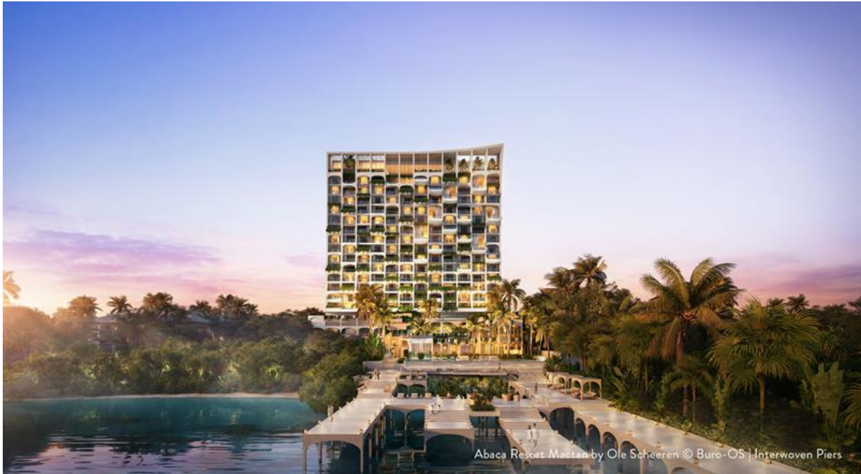
Set to be completed in 2024, the new Abaca Resort Mactan is CLI's very first resort development and will feature a timeless Sky Villas concept to serve as the platform for memorable getaways. The photo above is a perspective of Büro Ole Scheeren's architecture and innovative design of the re-imagined luxury resort to open in 2024.