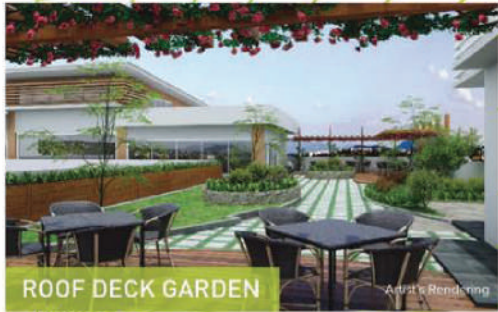
ROOF DECK GARDEN