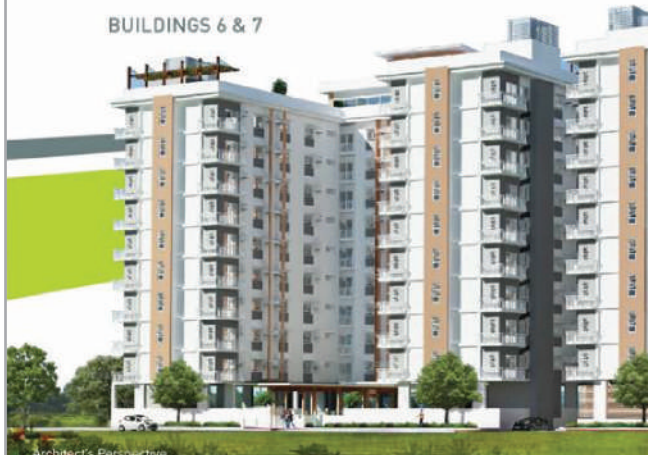
BUILDINGS 6 & 7